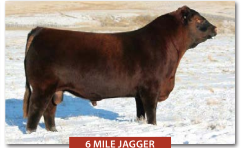
6 MILE JAGGER